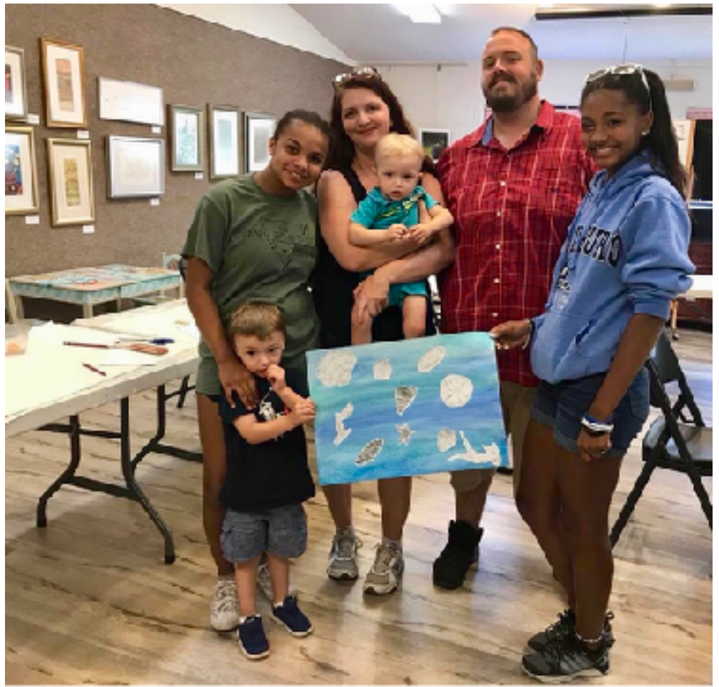
A family at last month's family fun night

I am also teaching children's art camps and adult drawing and painting courses out of our local Art League. When I moved to Hilton Head the first thing I did was head over to the local Art League and introduce myself. I was thrilled to be able to donate some of my art supplies and art room materials to their academy and within 2 months I was asked to join their board. It's been exciting to be a part of this organization and share my years of experience with them. I am hosting monthly "Lunch with the Masters" lectures at our local library and started our monthly Family Friday FUN Nights where families come and make a collaborative theme-based art work.