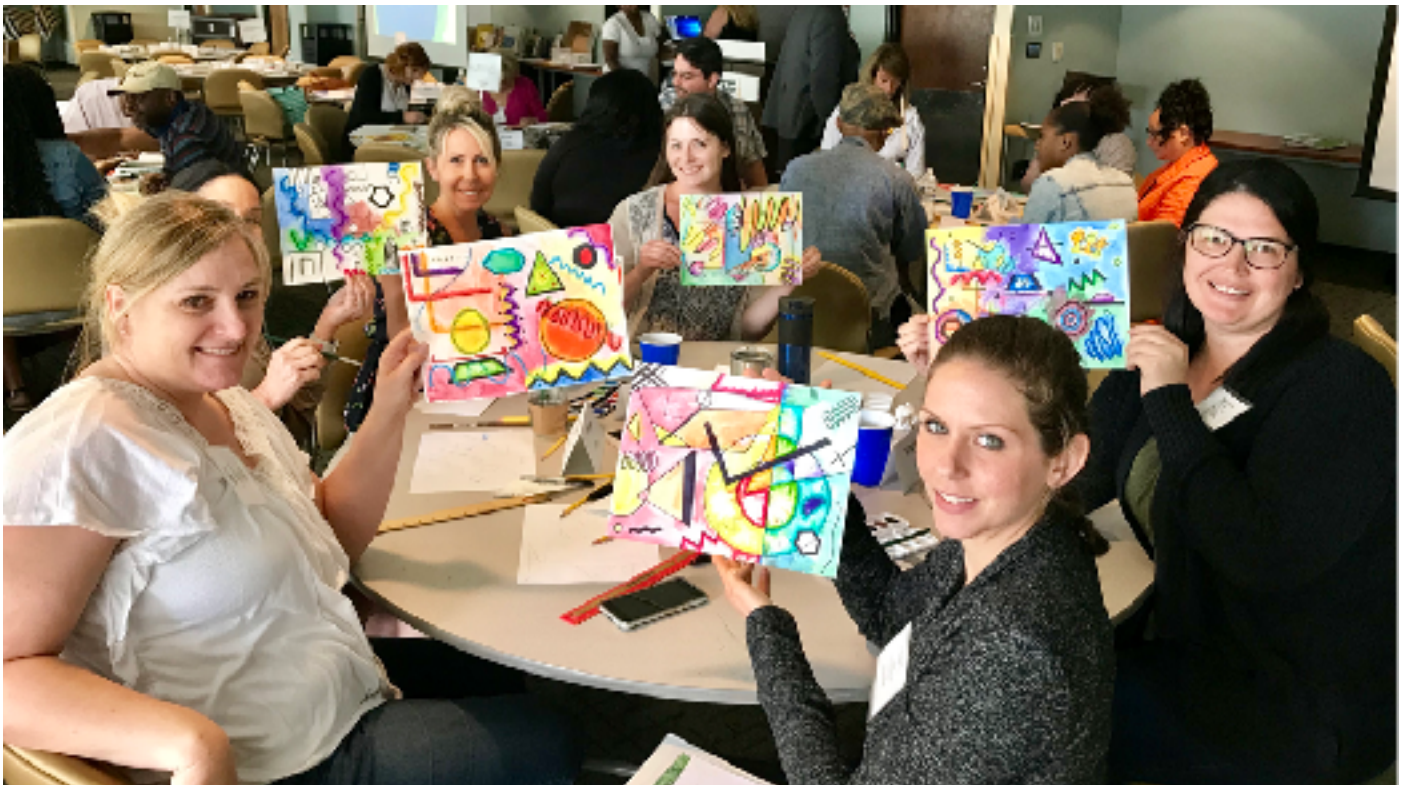
Working with classroom teachers in Atlanta

Since I left the classroom, I have been extremely busy as I'm sure most of you can relate. I have started a new consulting company where I am working with teachers and students by sharing successful teaching strategies. I am specifically sharing the powers of project based learning and hands-on experiences for our students and how this helps them authentically learn and retain what they learn! We have all been privy to this for years, so I am now sharing this "art teaching magic" with schools and districts across the nation. WESTpectations Educational Consulting has been a goal of mine for some time, so its nice to see it begin to grow wings!