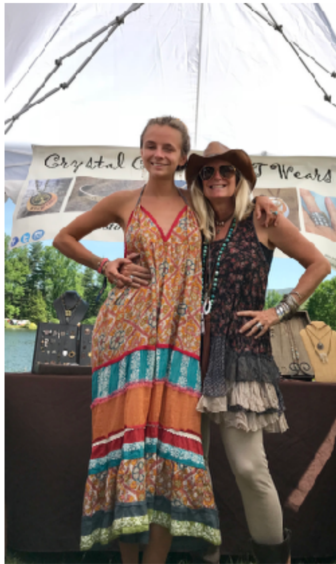
My daughter and me at the LEAF festival in Black Mountain NC last month

And I'm making my own Art! A lot of it! Now that I have the time to work in my garage studio I am painting, drawing, collaging and making my jewelry. I'm now able to attend more art festivals and exhibit