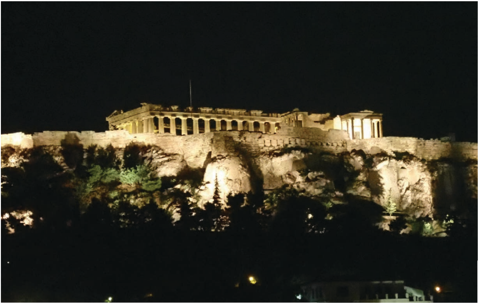
The Parthenon at night from our hotel roof top. Amazing!!!