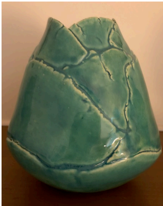
White Earthenware Clay, Slab construction, Aquamarine

I enjoyed teaching a ceramics class for adults in May and June at the McLean County Arts Center in Bloomington, Illinois. The students range of experience from extensive to none. Since their knowledge and skills were varied, I demonstrated various building methods and surface decoration techniques. I continued to build some of the in-progress forms that I used for demonstration. I donated the form pictured to the McLean County Arts Center Fundraiser Luncheon raffle. The proceeds of the Luncheon will be used toward equipment for the Center's studio spaces.