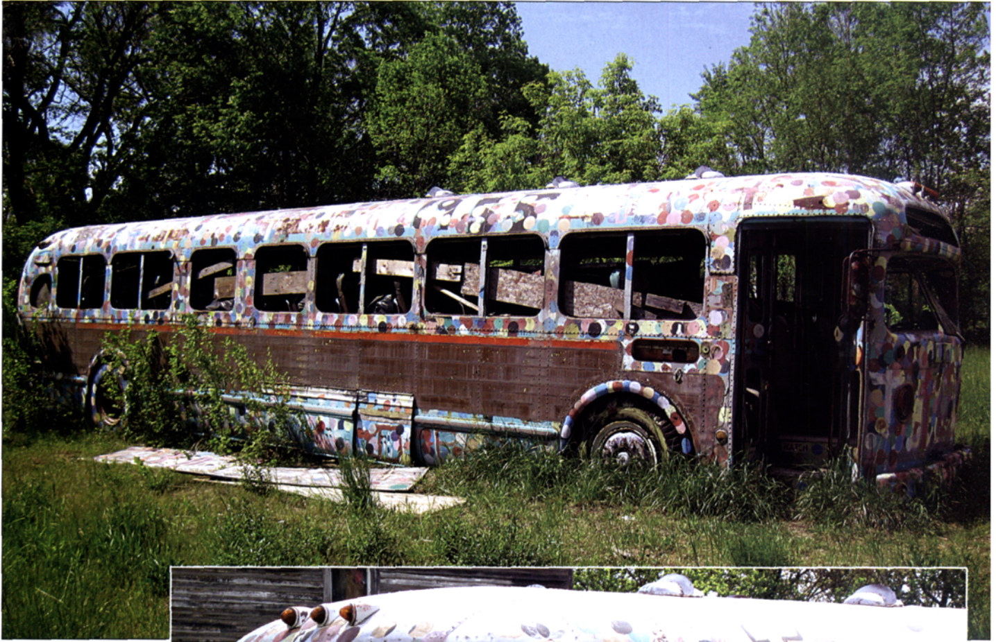
Move to the Rear. 1994–2000, current view.