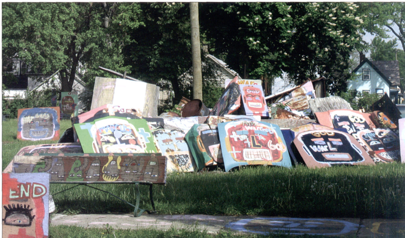
Faces in the Hood. 1994–present.