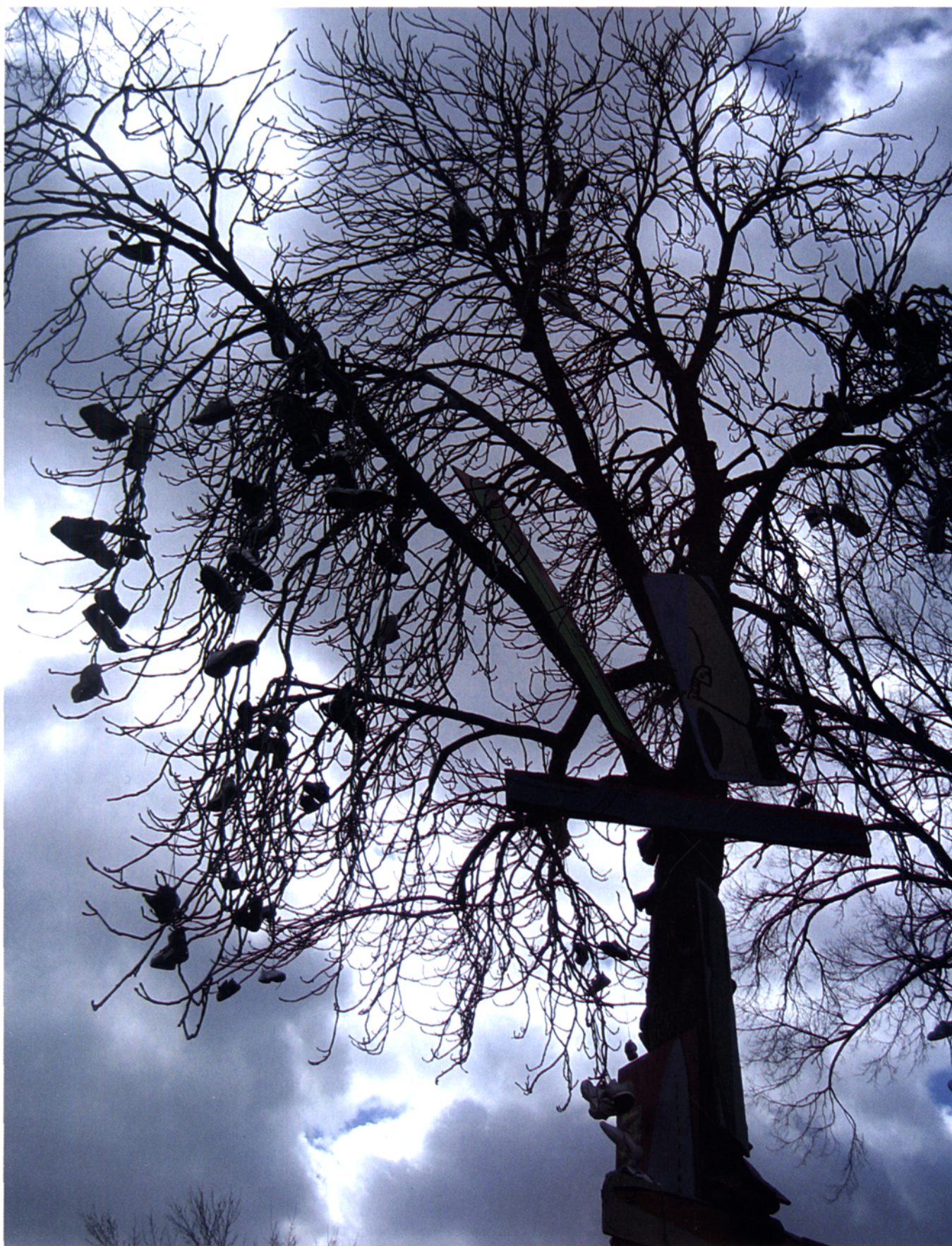
Soles of the Most High. 1993–present.