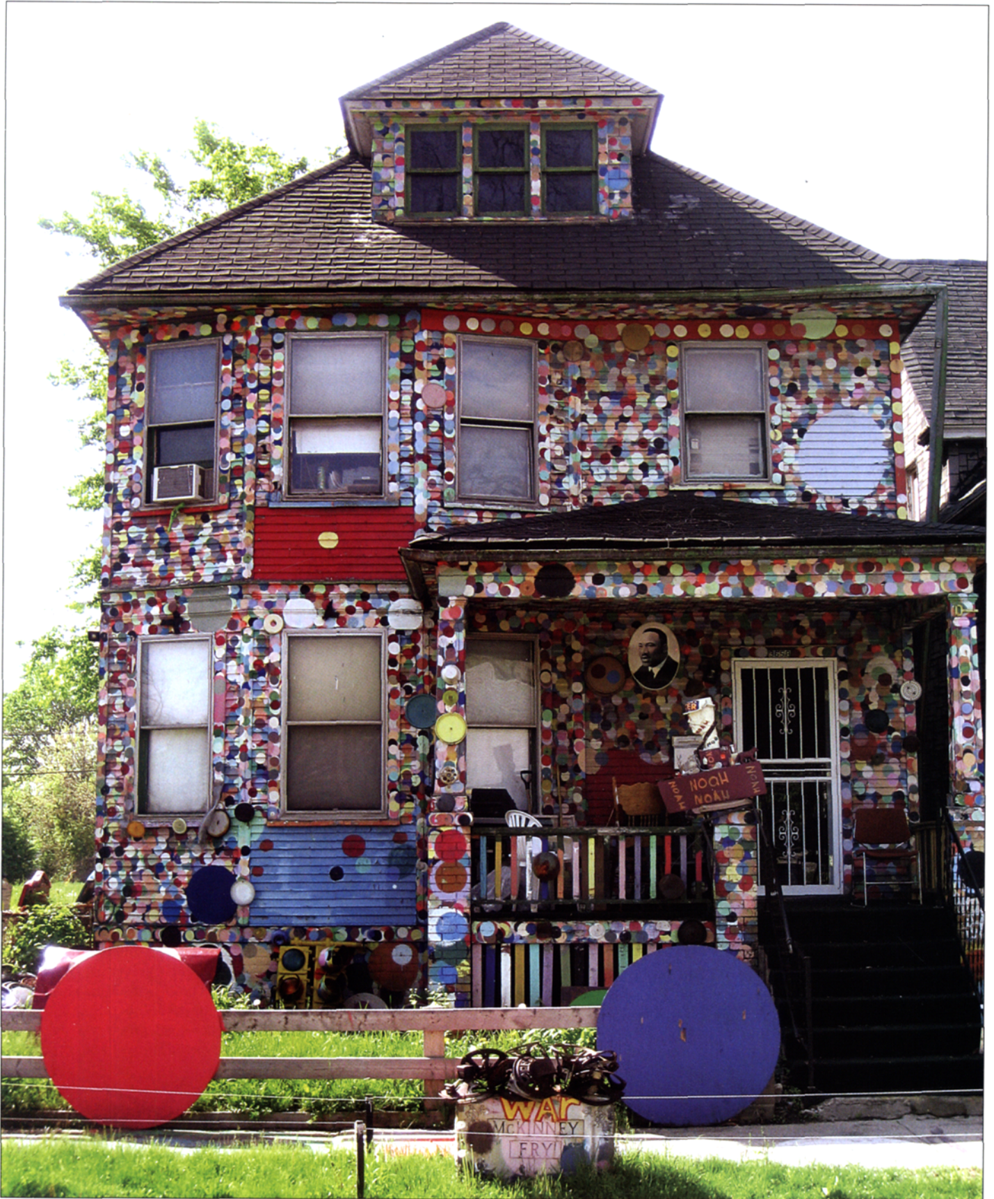
Dotty Wotty House, 1993–2001.