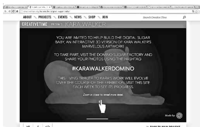
Screenshots of Web content that surrounded and shaped the installation.

"Ultimately it is the action and the context sparked by the work that matters most. Our engagement with the work and the activity around the work speaks to our political alignments. Together, an investigation of these alignments allows for greater awareness and hopefully the possibility for collective change."