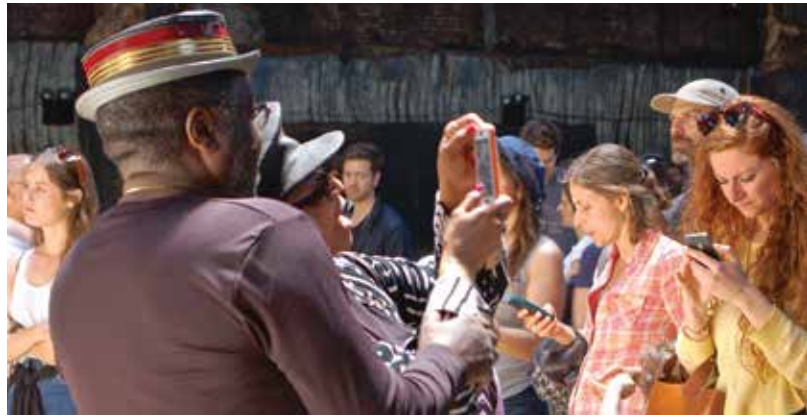
Individual and collective perspectives of A Subtlety .

“Dialogue brought forward by the work... can connect us to the larger discourse and the role that artists have to play in marking and provoking the social tensions of our time.”