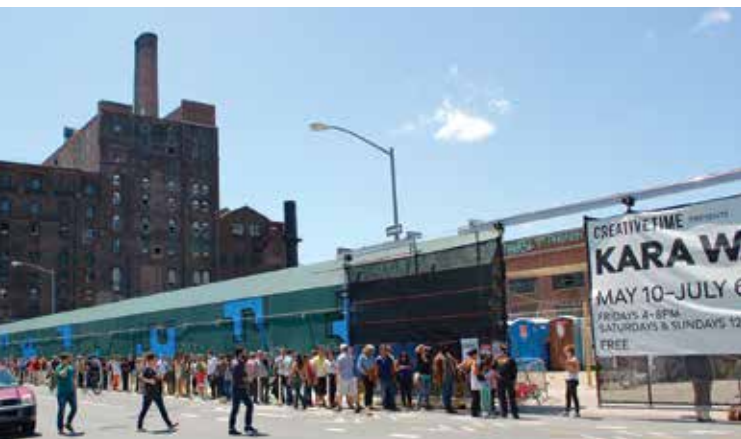
Factory line, 2014.

"A big theme that the work raises for me is how the market seems to become the ONLY value and permits people to disregard much of what makes life meaningful and joyful, pushing hierarchies of oppression and dehumanizing of sectors of society who are vulnerable—the identifiable (race, gender, orientation), and the poor, and the powerless (children)."