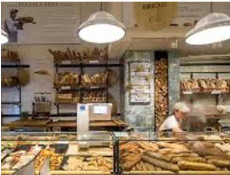
Eataly NYC Flatiron, New York

You can eat at the various small cafes or make reservations for the restaurants.