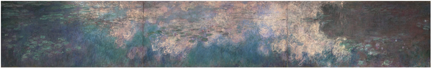
Claude Monet, Water Lilies . 1914-26. Oil on Canvas, three panels, each 6' 63/4" x 13' 11 1/4" Mrs. Simon Guggenheim Fund

After a $450 million renovation and four-month closure, 2019 saw a revamped New York art institution unveiled. The entire permanent collection has been re-curated for a brand-new more diverse exhibition area. The gift store is bigger and better than ever. The fifth floor Collection Galleries still boast Starry Night (van Gogh) and Water Lilies (Monet).