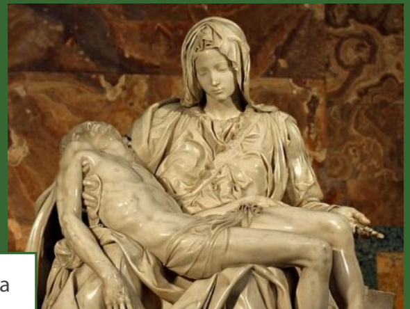
Michelangelo, Pieta , c.1498-1500