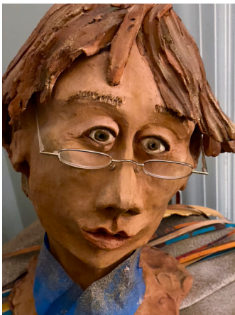
Upon This Foundation by Flowerree

Flowerree created the awesome artwork that is also shown below. The clay face is titled " Upon this Foundation " it is an earthenware/mixed media work. This humorous selfportrait sits on images of her life of family, students, colleagues and student travel. The gorgeous painting of the flowers and the flying insects is titled " Continuum III ", it is a mixed media work.