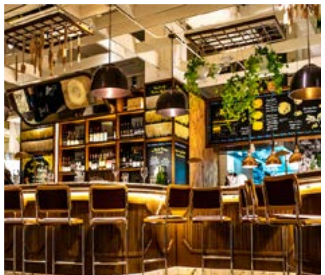
IL PASTAIO DI EATALY

Take a seat at our very own pasta bar. To dine at Il Pastaio, you must provide proof of vaccination.