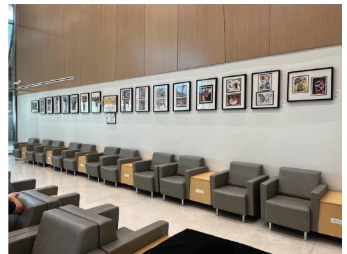
OAEA State Student Art Exhibition, Will Rogers World Airport, Oklahoma City

I wanted to share one more thing with everyone before I end my last article. When I started my tenure as President I wanted to share things that retired members in different states were doing. We have seen some great things haven't we? I know some states don't have a Retired representative on their board, but I have seen many more added in the past two years. That is AWESOME!!!