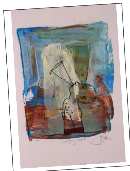
Looking Out II by James Rees