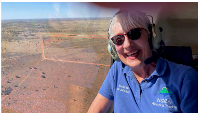
Helicopter ride, Northern Territory Australia 2023