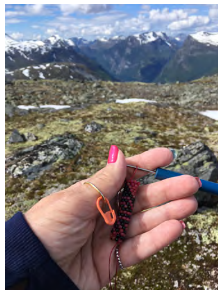
Crocheting, on top of Mount Dalsnibba in Norway