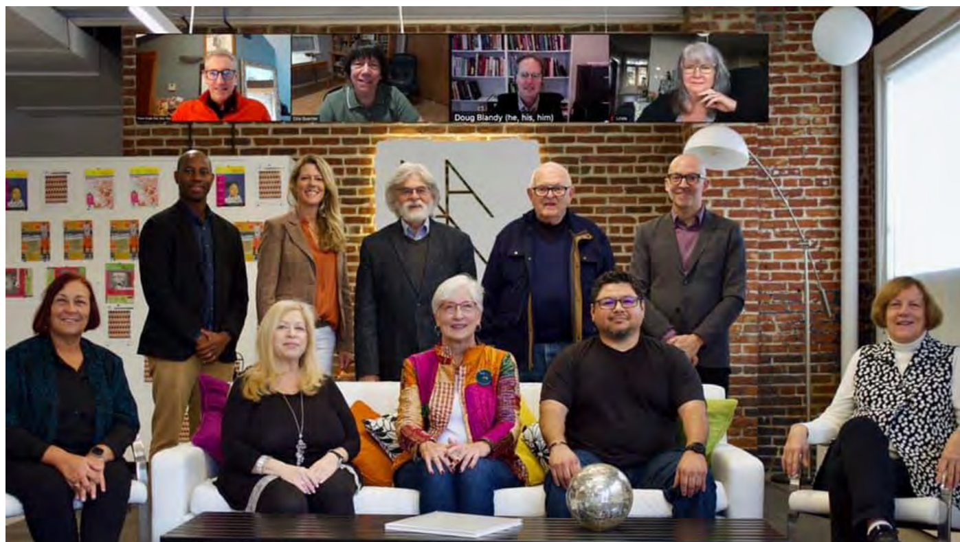
NAEF Trustees, 2021

My advice: be open and flexible to where life's path will take you. Cheers!