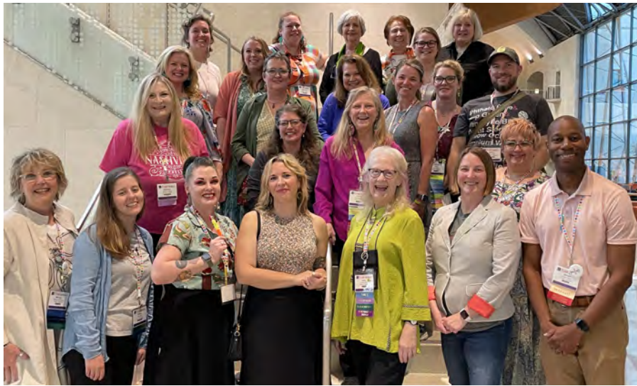
Tennessee Group Picture