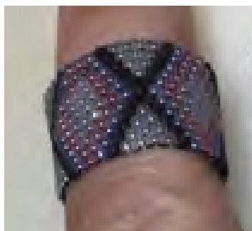
Beaded ring - Kathryn Hillyer