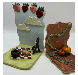
Bookends created by Adrienne C. Nelson High Ceramic II students, Oregon