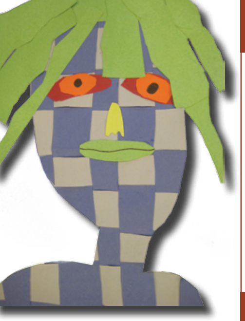
Pope N., Grade 4, "Weaving Good Character" © 2008, Crayola LLC