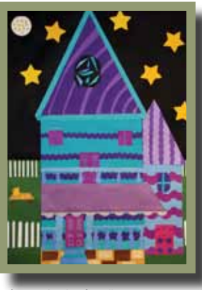
Juhaina Q., Grade 5, "Victorian House © 2008, Crayola