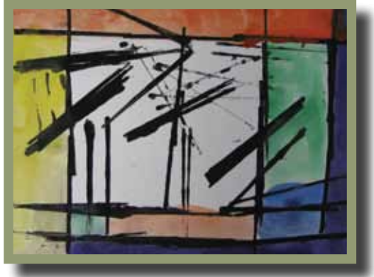
Sadie M., Kindergarten, "Grasshopper" © 2008, Crayola LLC*