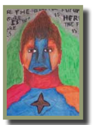
Brendan B., Grade 6, "The Future Is Here" © 2008, Crayola LLC