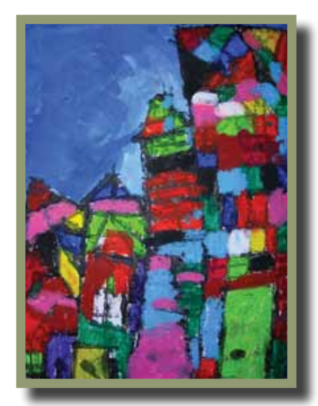
Shania V., Grade 2, "The City" © 2008, Crayola LLC