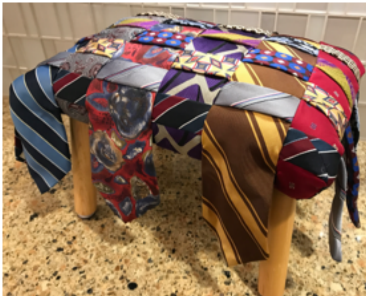
Salvaged stool covered with ties