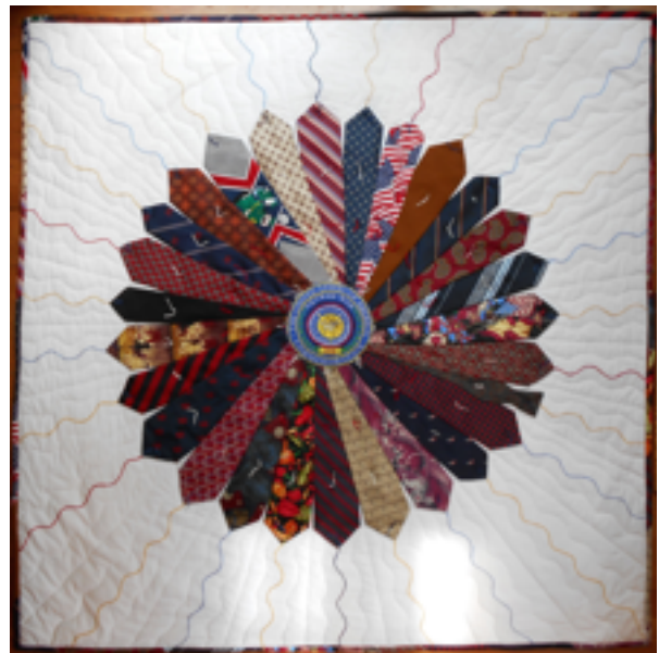
Vietnam War 50 th Anniversary Commemorative Tie Quilt won awards in the 2017 NSDAR American Heritage Contest: two first place awards in Virginia (hand quilted wall hanging and "Service to America") and was forwarded to the national competition where it won second place nationally for hand quilted wall hanging.