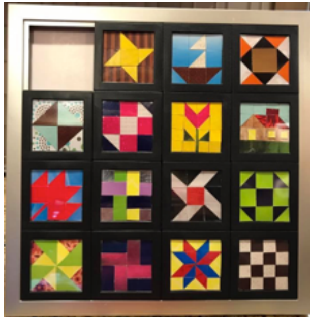
Sliding tile frame filled with 15 quilt square designs made from recycled cardboard containers