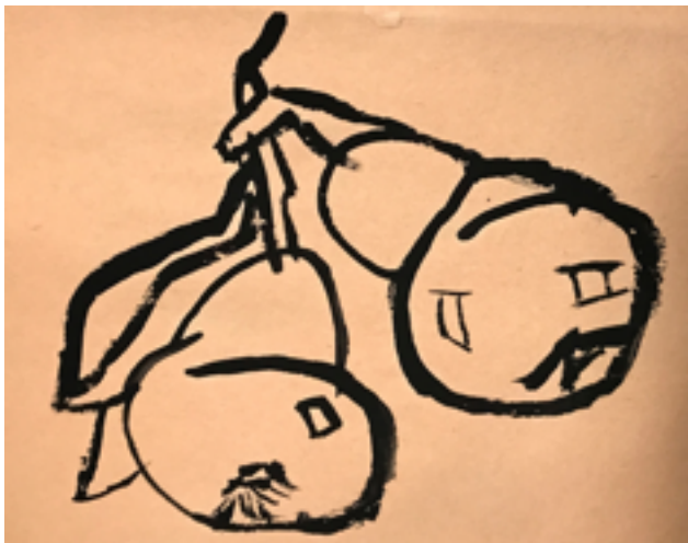
Paintings made on first easel at age 6 or 7.