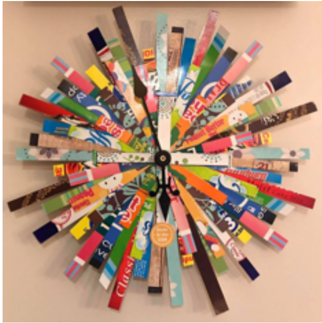
Clock from recycled cardboard containers